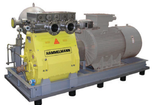
HDP 755: Plunger Process Pump